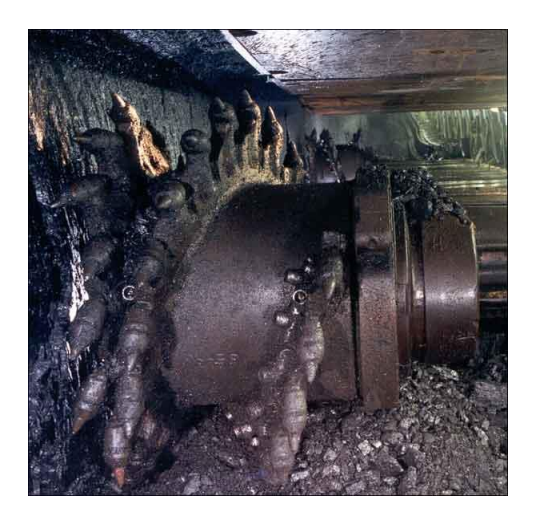
Figure 5: Longwall miner (BLM)

If the coal is much deeper than several hundred feet below the surface, the best method for extraction is a traditional underground mine. The process of mining, though, is anything but traditional. Today's mining operations rely on heavy tunneling equipment to extract the coal instead of dynamite, pickaxe, and shovels. Figure 5 shows a picture of a longwall miner operating in Utah. In this type of operation, large rectangular blocks of coal are apportioned within the seam and then carved out by cutting paths through it. The large blocks are then removed in one continuous cutting by the machinery as it moves back and forth across the block face<sup>9</sup>. Operations like this pose several hazards, though. One is that the mine might cave in as supporting coal is removed. This is generally taken care of by large hydraulic systems that support the mine while operations are in process. There is also the hazard of explosion from methane gas and coal dust that build up in the air. As the coal is cut, methane that is trapped in the coal is released, and small chips of flammable dust get into the air. These