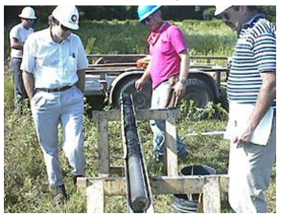
Figure 3: Core sample from a well

The process of searching for coal begins by doing detailed geological surveys of the area to see if there is a potential for finding it in the region. This involves stratigraphic studies on the sedimentary layers there. This type of study attempts to determine the extent, age, and depositional environment of the sedimentary rock layers. To aid in this process, core samples might be taken in the region by drilling wells. These core samples can aid in matching up layers over long distances, as well as possibly detecting the presence of coal. Sometimes, enough evidence is found from this type of study to go forward with a mine. However, the information might be backed up with a seismic survey of the area to confirm the size and locations of coal in the subsurface. It might also help to decide on the best approach for extracting the coal.