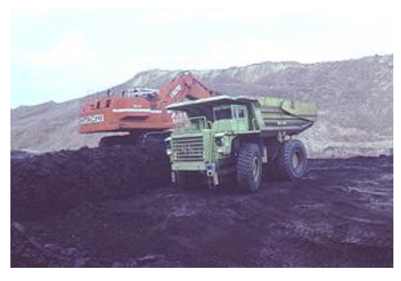
Figure 4: Strip mine in the Gulf Coast

The method of production of the coal depends greatly upon its location in the ground. If the coal is found within several hundred feet of the surface, then the most reasonable method of extraction is strip-mining. This process involves removing all of the sediment and rock that lies over the coal in order to expose it. The coal is then scooped from the ground using very large cranes and trucks and driven directly to trains that take it to market. When all of the coal is removed from a location, federal law mandates that the land be remediated to its previous state. The means that the removed sediment and rock is put back in place, and vegetation is planted.